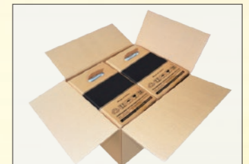
大容量/高強度瓦楞紙箱 Strong and large corrugated cartons.