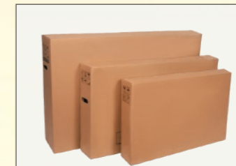
大型家電瓦楞紙箱 Large appliance corrugated cartons.